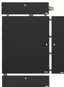
Typical battery/wiring setup with Trove3 Enclosure (not included)